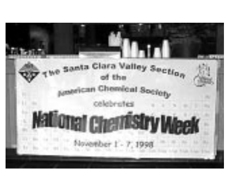
Banner welcoming teachers to the workshop