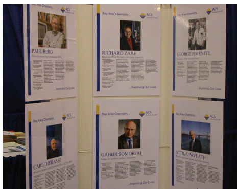
Some posters at our booth