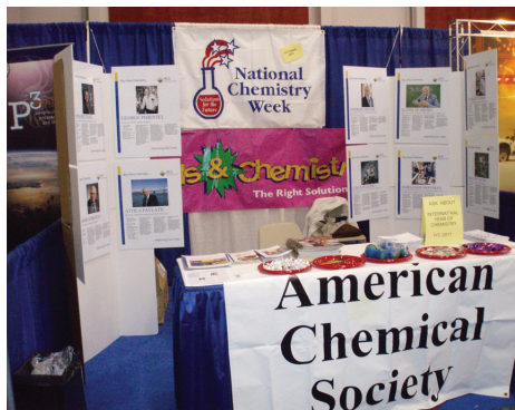
SCV ACS booth