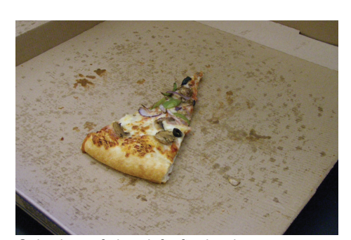
Only piece of pizza left after lunch