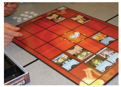
Game Board in Play