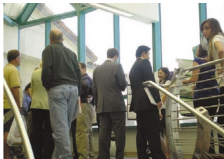
Group shot at the poster session