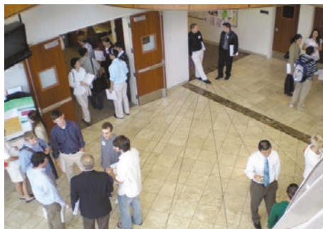
Group shot at the poster session