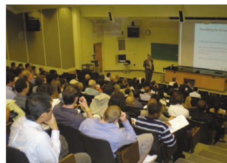
Dick Zare's Keynote