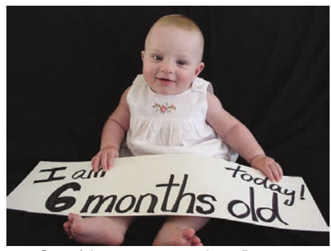
One of the youngest members: Bronwyn