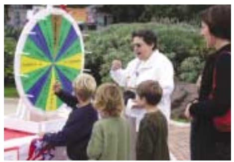
Wheel of fortune.