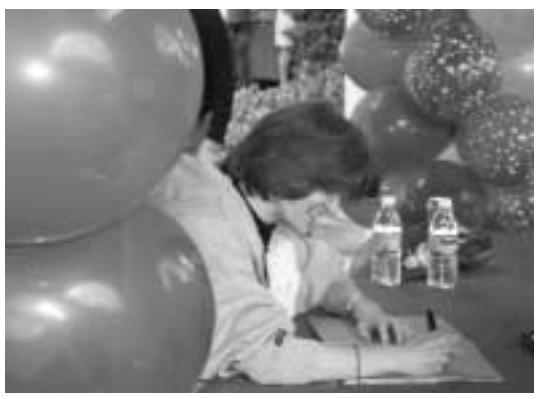
Sally Ride autographs a book.