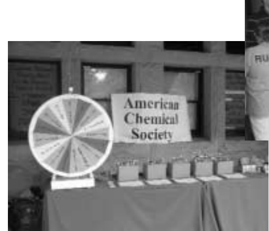
More scientists join in on the fun!