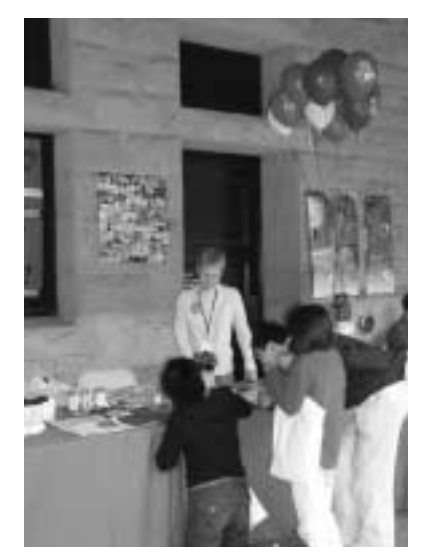
Here come the next generation of scientists!