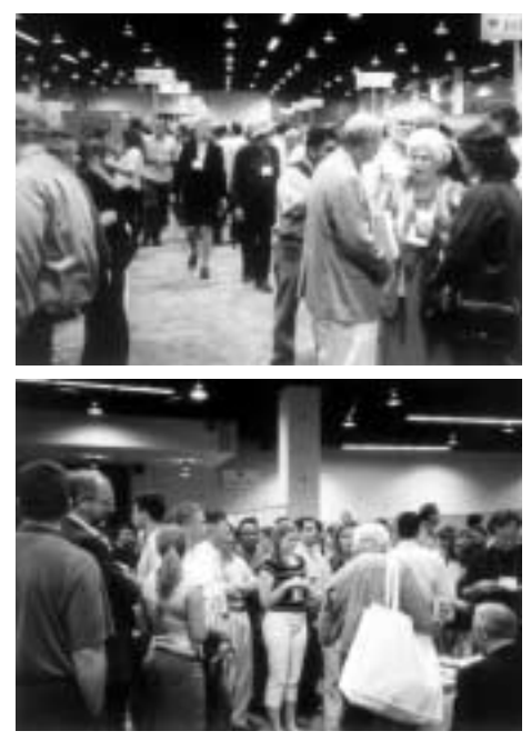
The Sci-Mix Crowd.

Sally Peters reports from the Local Section Activities Committee (LSAC) that our section was one of the 155 sections to get their annual report in on time, and one of 150 to submit the report electronically. Our section also