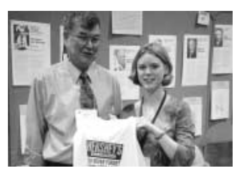
CHAL's chocolate and T-shirt drawing winners!

This year's Synopsys Championship was held at the San Jose Convention Center on Wednesday, March 17th. This regional science fair program is sponsored primarily by Synopsys and its Outreach Foundation and focuses on the all aspects of science and engineering (see bttp://www.outreacb foundation.org/about.btml and www.synopsys.com ). The projects for seventh and twelfth graders were primarily for first-time science fair participants to encourage them to proceed further in the state and international fairs. About 600 students participated with a variety of science and engineering projects.